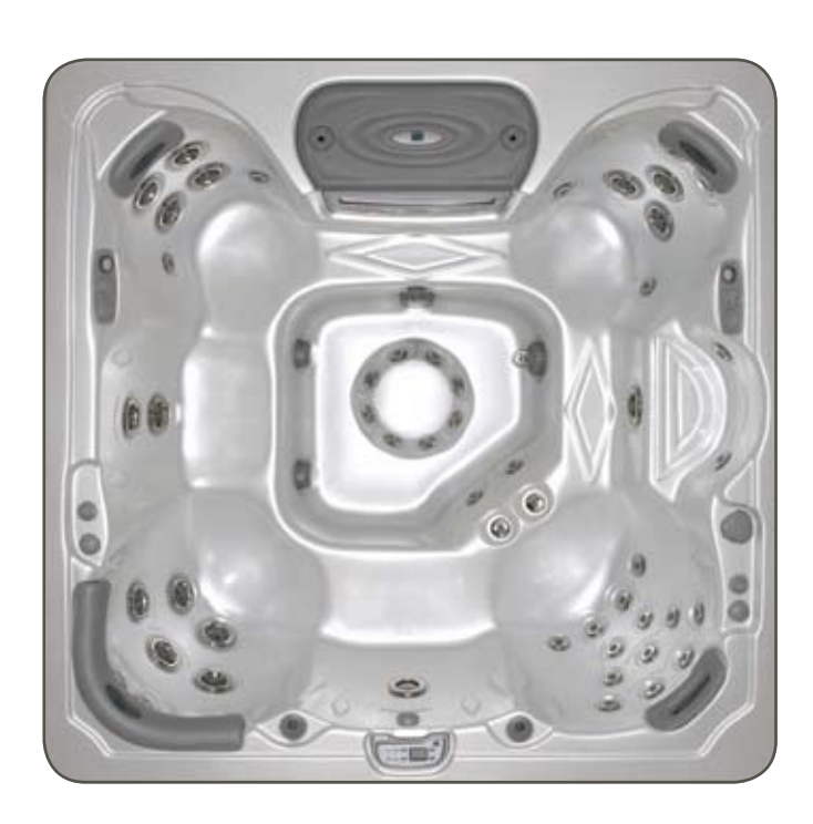
2.35m x 2.35m x 0.95m

This feature-packed Platinum spa shares similar dimensions and assets with the Cypress Point. However, the Pacific Dunes has a dedicated lounger, along with dual rotating foot jets and calf massage jets, which makes this a unique spa. With 52 high-performance jets, a jetted cool-down seat, lounge leg massage and jetted footwell you need to look no further than the Pacific Dunes for a large luxury lounging spa.