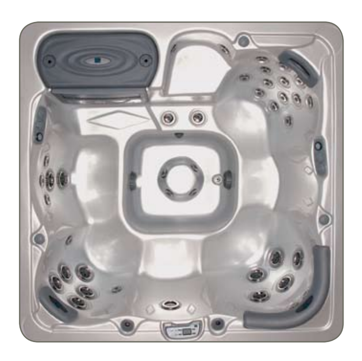
2.08m x 2.08m x 0.95m