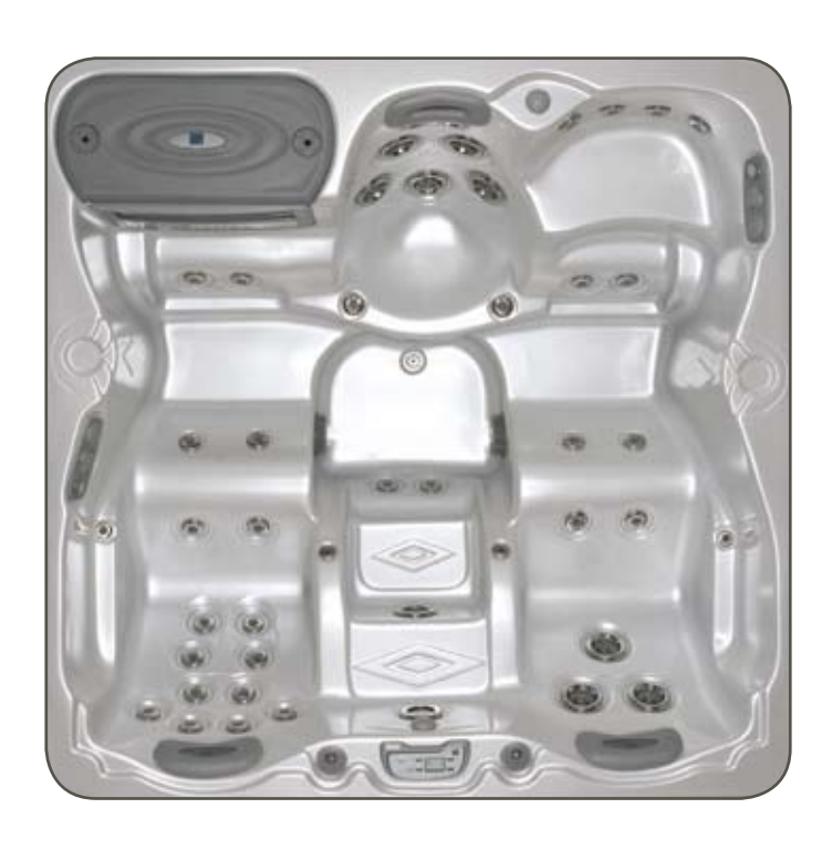
2.08m x 2.08m x 0.95m