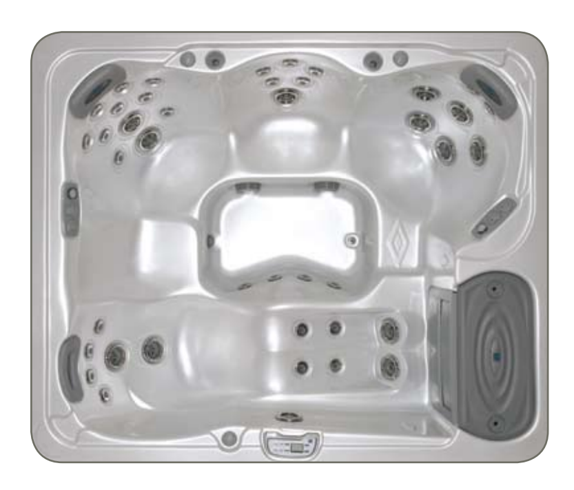
2.35m x 1.96m x 0.87m