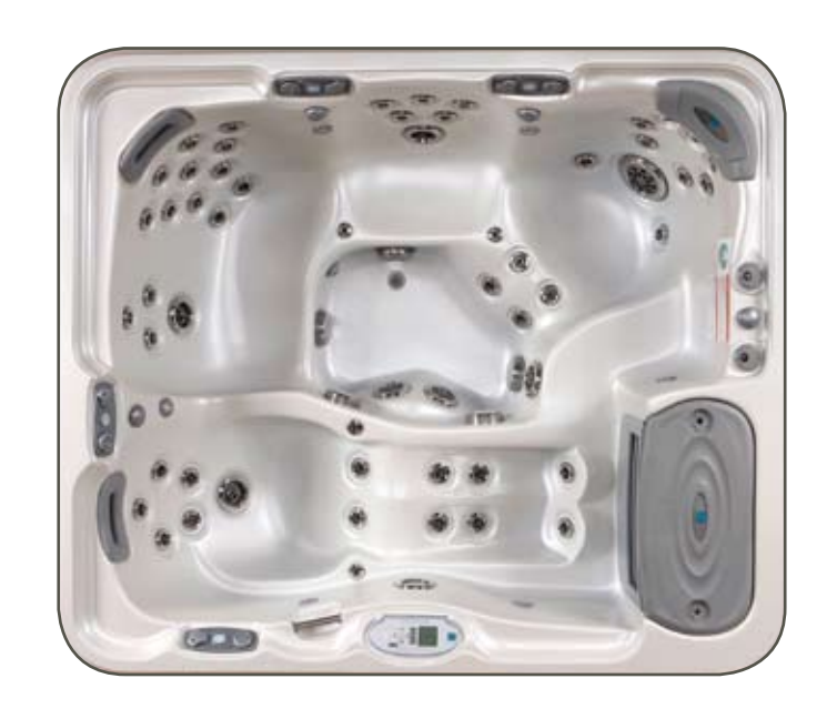
2.35m x 2.02m x 0.87m

This feature-packed Platinum Elite spa shares similar dimensions and assets with the Piper Glen. However, its dedicated lounger, with dual rotating foot jets and calf massage, makes this a unique spa. A hallmark of the Platinum Elite line, the versatile triad seat features wraparound, high-flow, adjustable jets and offers multiple variations of hydro-massage options.