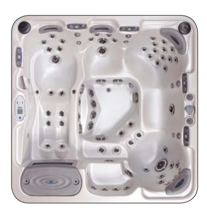
2.35m x 2.35m x 0.95m

This midsized spa is ergonomically designed to keep you in place as the jets work their wonder. This spa offers a dedicated lounger with armrests and a dynamic, super-massage foot and leg well in the lounging position. The Quail Ridge is a space saving spa that will fit through most doors, yet it easily gives you all the luxury and comfort that are characteristic of the Platinum Elite spa line.